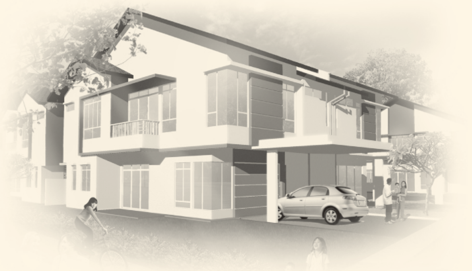
32' x 70' 2-Storey Cluster